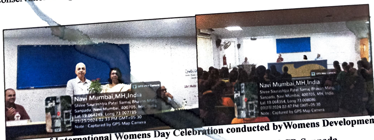
Glimpses of International Womens Day Celebration conducted by Womens Development Cell (WDC) and Institute Innovation Council (IIC) at OCP, Sanpada

4. Plantation Drive: As a symbolic gesture of nurturing growth and sustainability, the felicitated guests were presented with saplings, underscoring the importance of environmental conservation alongside women's empowerment efforts.