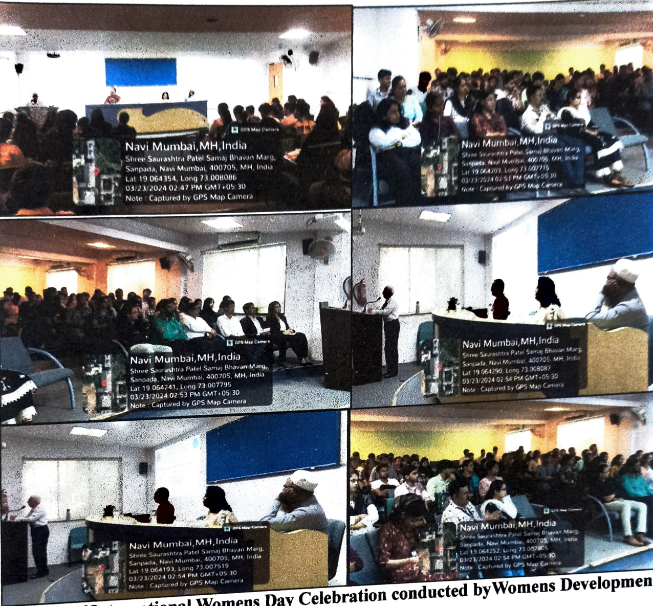
Glimpses of International Womens Day Celebration conducted by Womens Development Cell (WDC) and Institute Innovation Council (IIC) at OCP, Sanpada