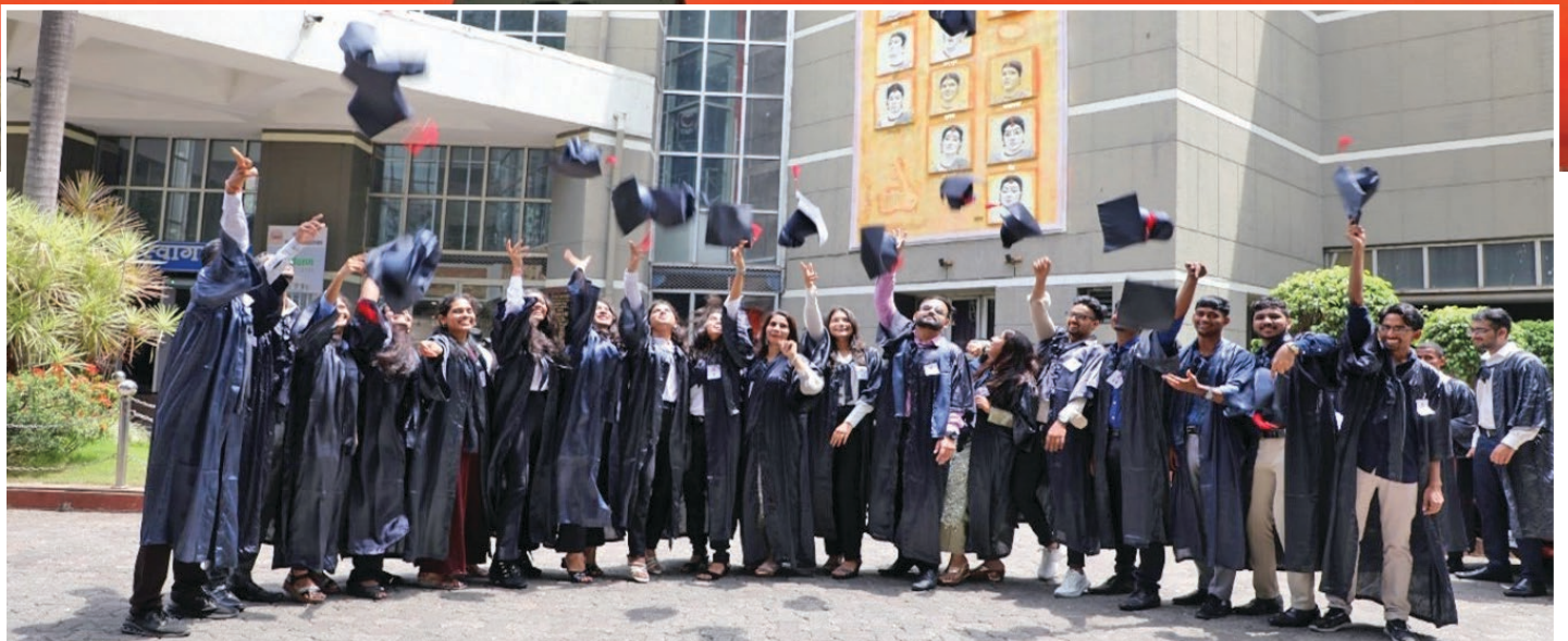
Annual convocation ceremony for degree distribution of 2021-22 passed out student was organized at Vishnu Das Bhave Auditorium, Vashi on 27th May, 2023.