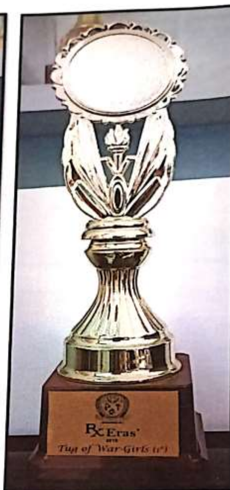
Rx (2018-19) Tug of War

Plot No. 3,4 & 5 Sector -2, Near Sanpada Railway Station, Sanpada, Navi Mumbai – 400705.