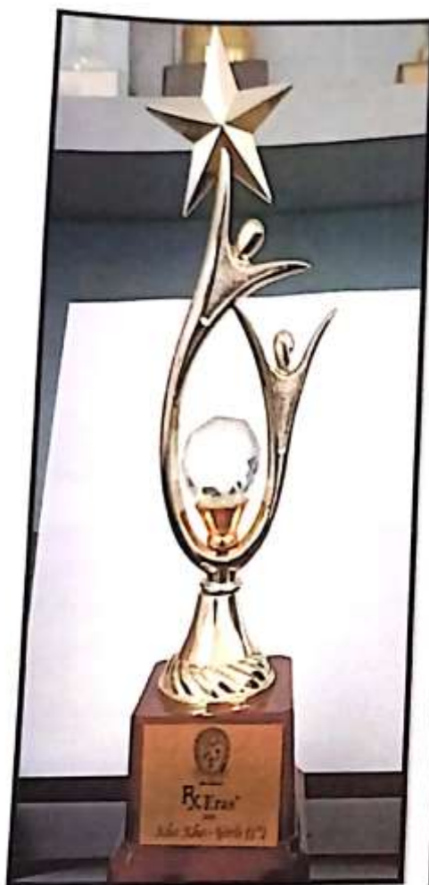
Rx (2018-19) Kho-Kho