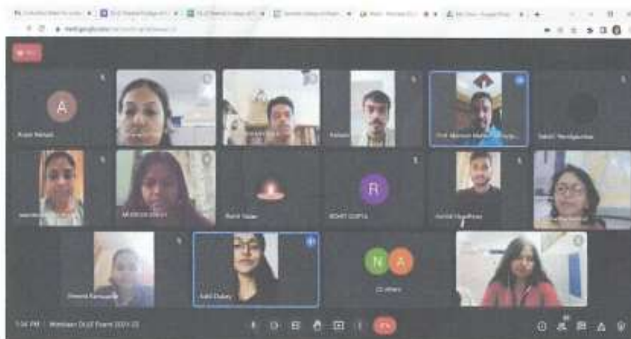
Principal, judges, Co-ordinator and all the Students Managers joined online for welcome speech