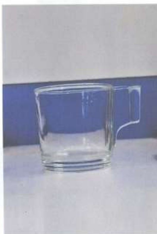
The glass cup which has been distributed by the students to the faculty members