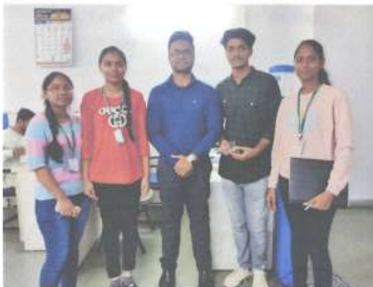
Faculty member with the group of DLLE students who supported their initiative