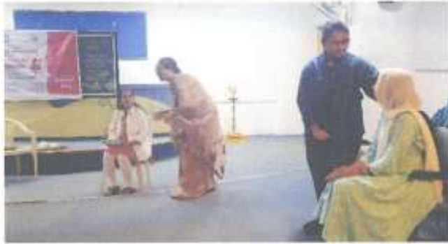
Skit performed by 1 st winner