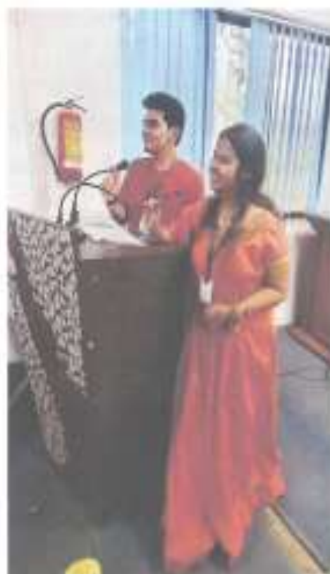
DLE Students from S.Y. hosted the event