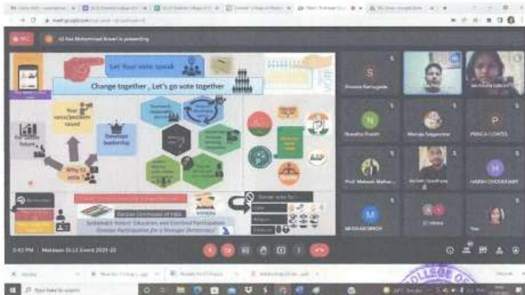
One of the winners' poster