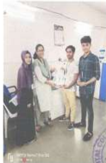
Faculty members with the group of DLE students who supported their initiative

Plot No. 3,4 & 5 Sector -2, Near Sanpada Railway Station, Sanpada, Navi Mumbai – 400705.