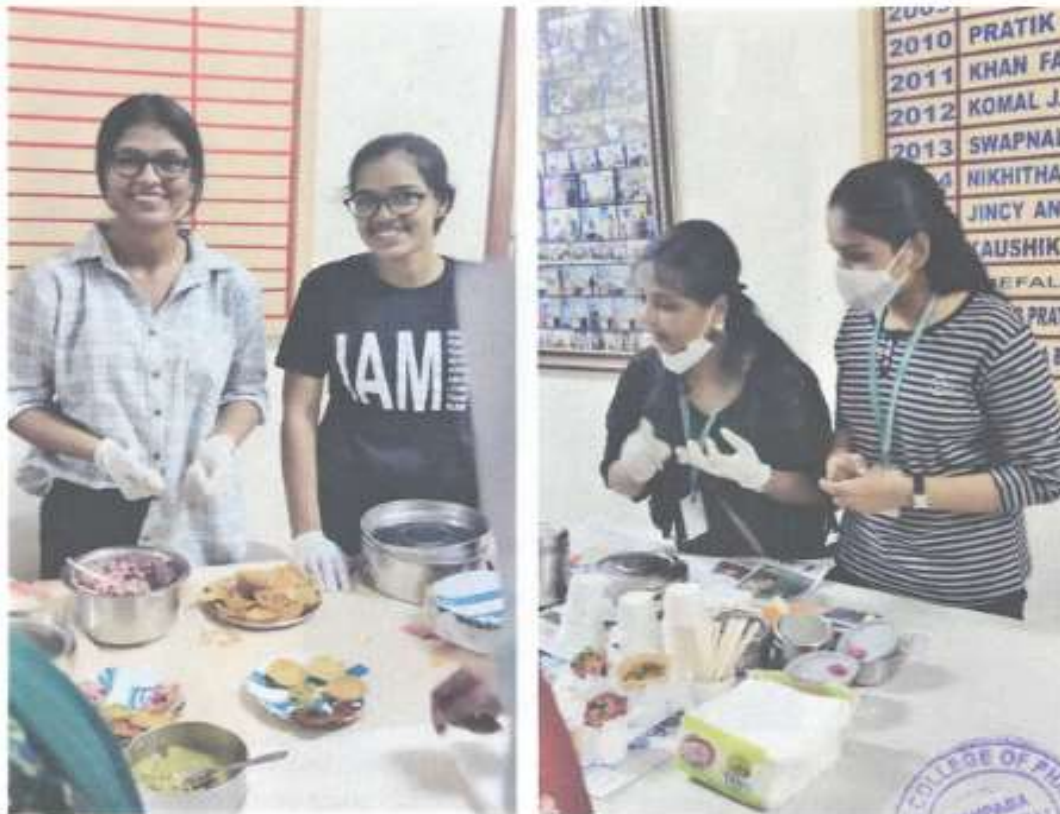
Winners of the competition