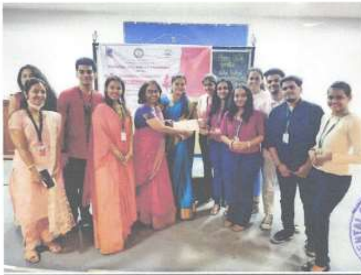
Awarding 2 nd winner from OCP with cash prize