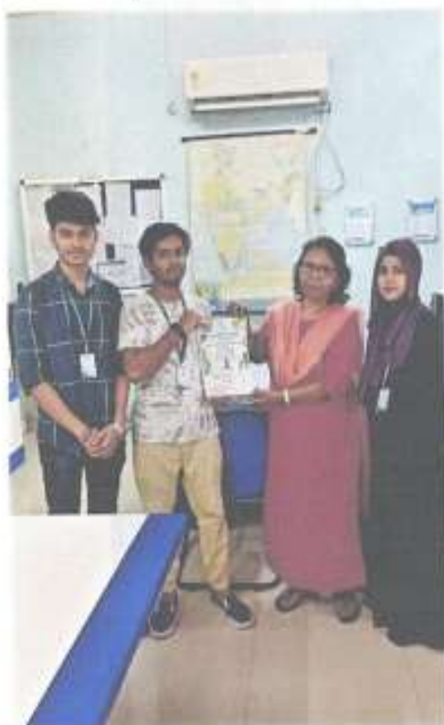
Principal Mam with the DLE students, encouraging the initiatives taken by the students

This initiative was taken at small institute level with a hope to take it to next level each year.