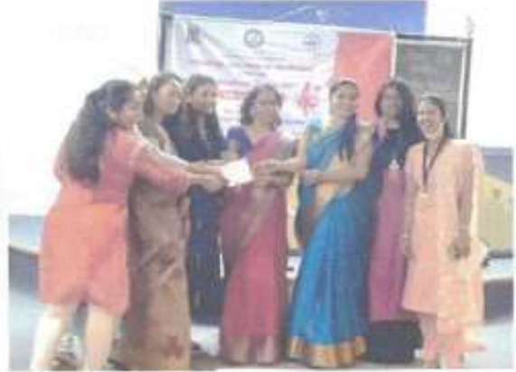
Awarding 1 st winner from B.Ed. with cash