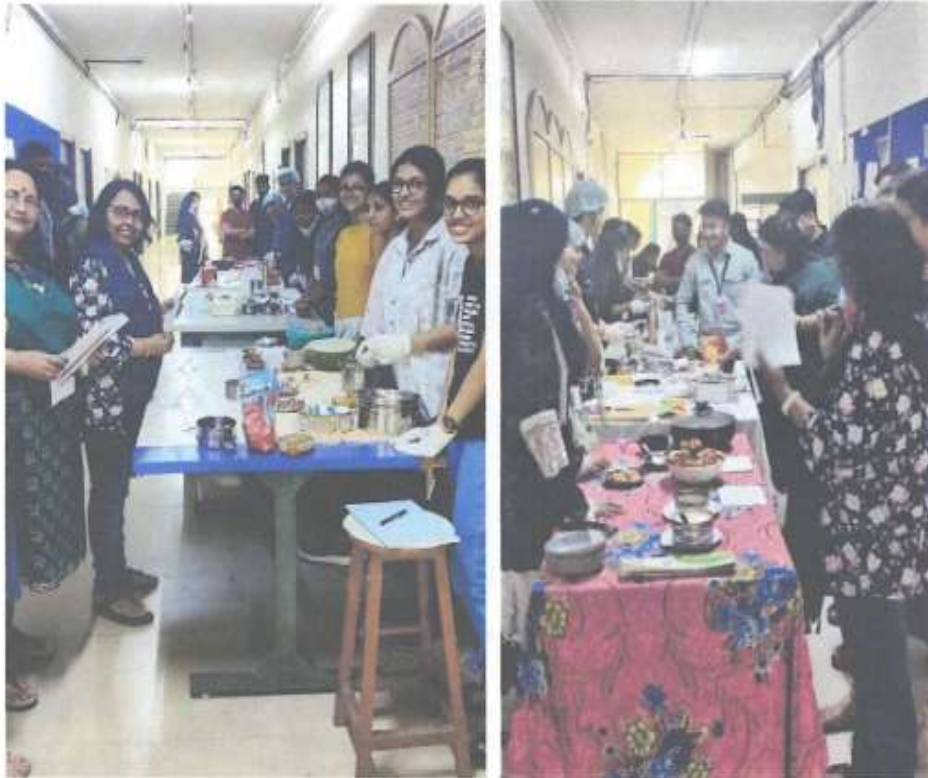
Participants displayed their prepared millets food items for tasting of judges and selling purpose

The first and second winners bagged exciting gifts and others participants were awarded with certificates.