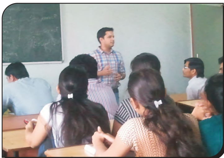
FIRST ALUMNI MEETING