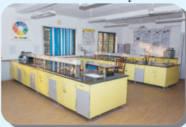
Quality Assurance Lab