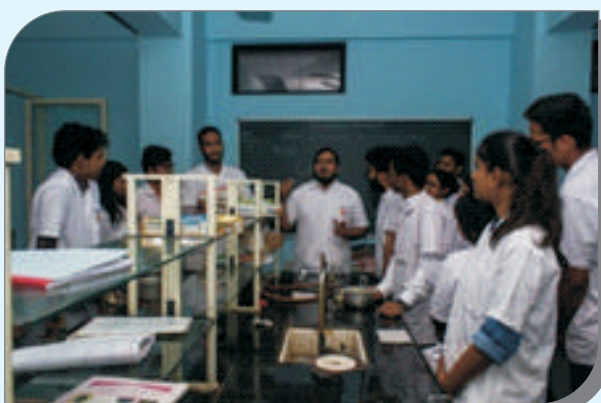
Pharma Chemistry Lab