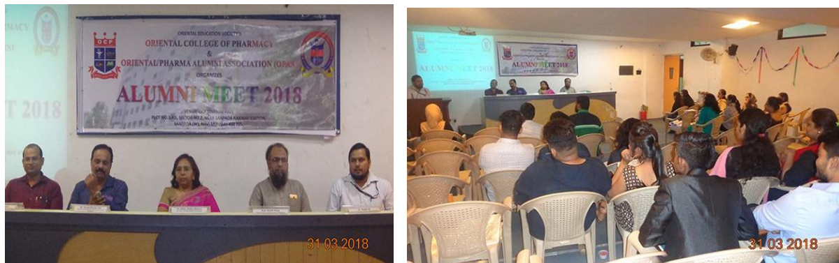
Photo Gallery of Alumni Meet