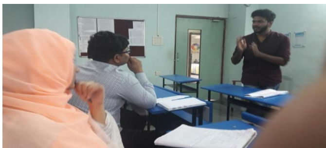
Photo Gallery of Guest Lectures