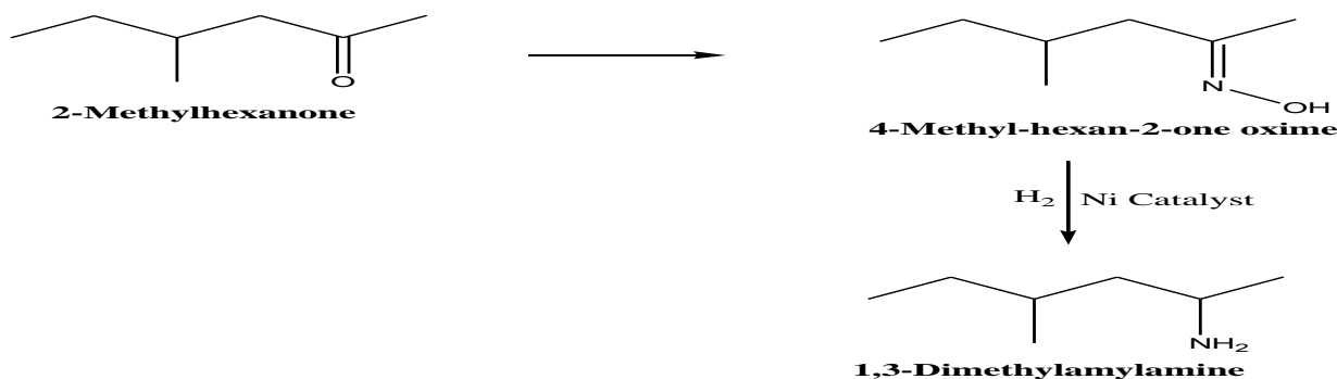
Scheme 1: Steps for synthesis of Geranamine.

It was first made in the early 1940s and patented in 1944 by the American pharmaceutical manufacturer, Eli Lilly. They synthesised it in a two-stage reaction starting with 2-methyl hexanone. First, they reacted it with hydroxylamine, forming an oxime by means of a condensation reaction. Then, in the second step, the oxime group was reduced, here achieved by catalytic hydrogenation (Scheme 1). They were trying to make a substance that would supplant amphetamine as a nasal decongestant. Eli Lilly marketed methylhexaneamine under the trade name Forthane from 1948 until they withdrew it from the market in 1983.