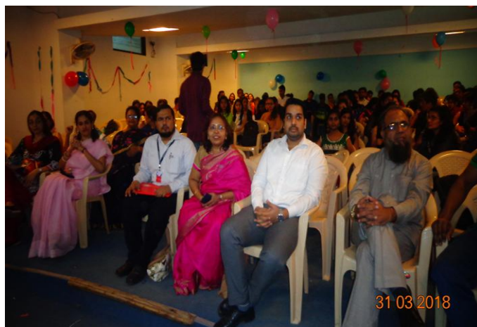
Photo Gallery of Entrepreneurship Development Cell Meeting