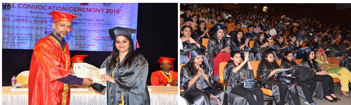
Photo Gallery of Convocation Ceremony