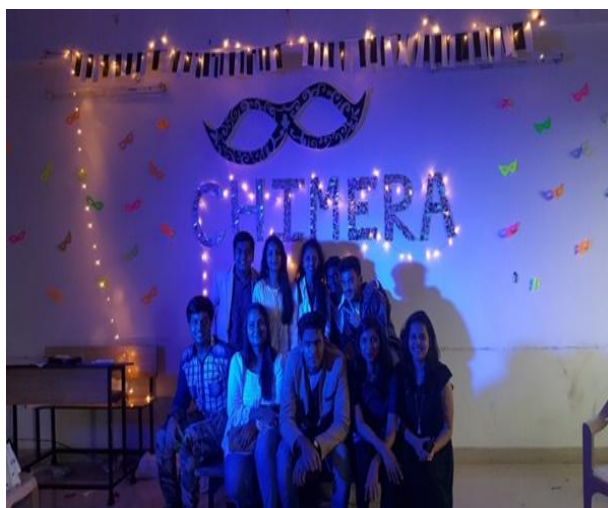
Photo Gallery of Freshers Party