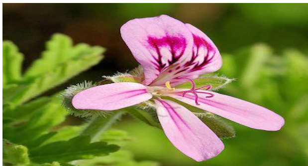
Figure 1: A. geranium (Pelargonium graveolens).

Several studies reported that there was no evidence for it in geraniums or geranium oil, and that supplements containing it therefore contained synthetic methylhexaneamine. However, since 2012 it has been detected by other research groups. It is possible that it is only found in some geranium plants, and it is also possible that some extraction and workup processes to get the amine from the plants may not extract it, or that it may be lost during extraction on account of its volatile nature.