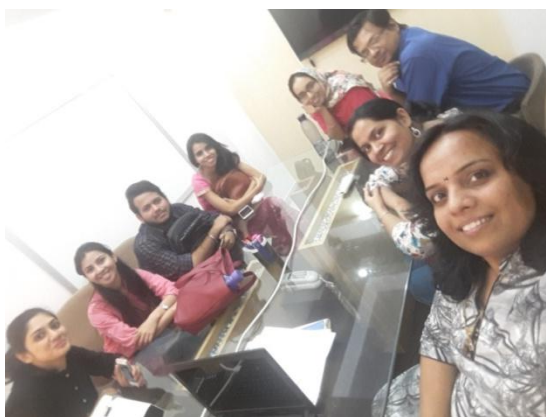
Photo Gallery of Anchrom Industry visit