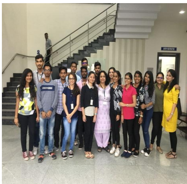
Photo Gallery for Industrial Visit at ACG Associated Capsules, Shirwal